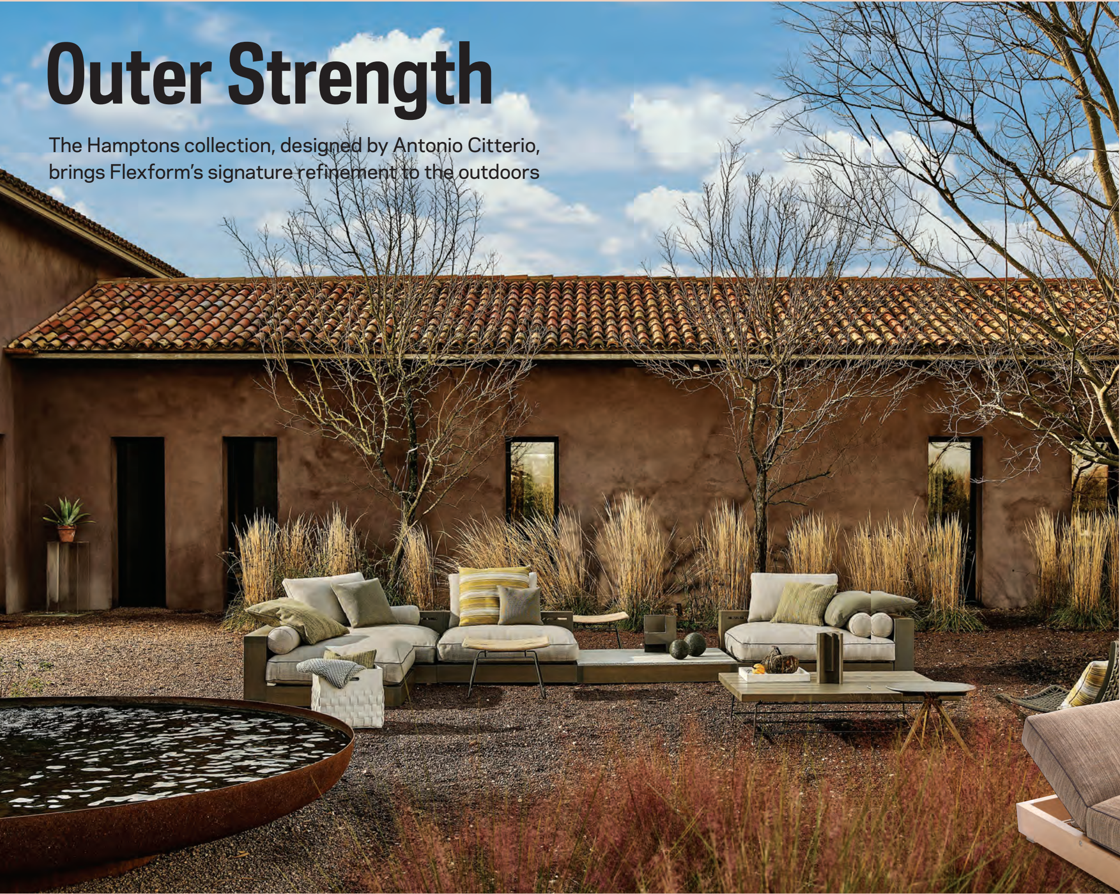
The Hamptons collection is defined by its durable, elegant materials, including solid iroko, sumptuous fabric and enduring stone.

The Hamptons collection, designed by Antonio Citterio, brings Flexform’s signature refinement to the outdoors