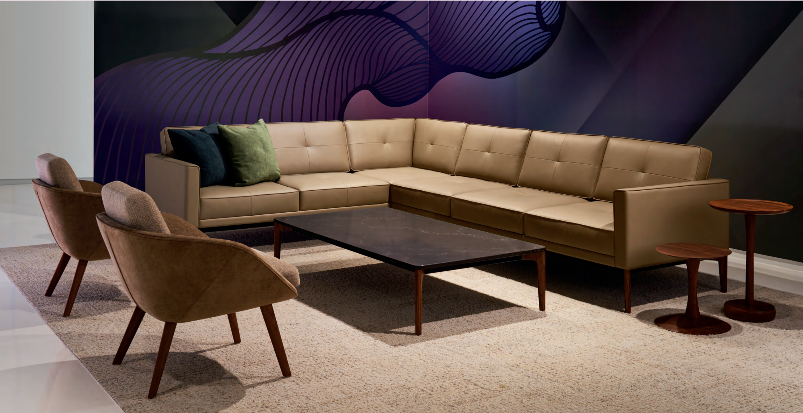
Clean-lined silhouettes, grid stitching and framed back details unify the Swav seating family.