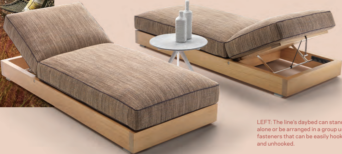
LEFT: The line’s daybed can stand alone or be arranged in a group using fasteners that can be easily hooked and unhooked.

But for all their durability, sustainability and performance, it’s not the practicality of Hamptons’ materials that you’ll notice. It’s how these noble elements — solid wood, sumptuous fabric and stone — create an atmosphere of casual elegance, quality and, above all, comfort. flexform.it